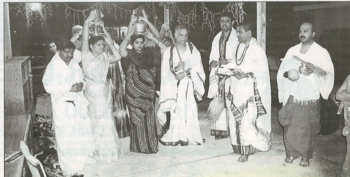
Devotees gathered at Balaji Temple to mark Shivaratri as well as the temple’s sixth anniversary.